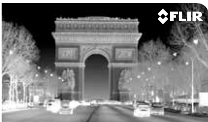
Thermal image of the Arc de Triomphe, Paris, France.